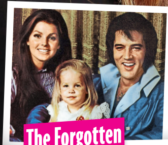
The Forgotten Photo Album

PLUS: Riley Keough on finishing her mom's bombshell book: 'It's bittersweet'