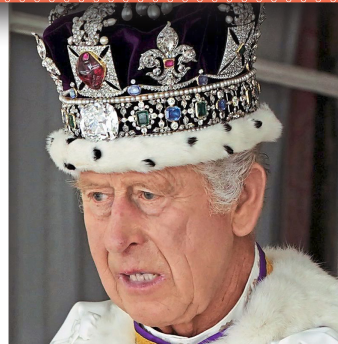
Sick Charles FORCED TO PUT THE CROWN FIRST