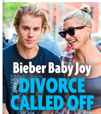
Bieber Baby Joy DIVORCE CALLED OFF